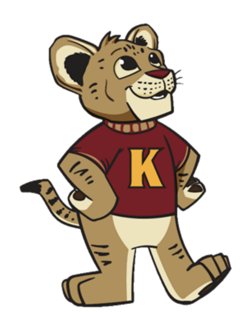
School & District Information, Policies and Procedures Safe School Climate